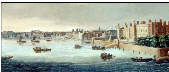
Fig. 48. Cornelis Bol. c. 1650. Ref DPG 360. On the right is Old Somerset House, shown before Webb's alterations to the river facade of 1662; on the far left is Lambeth Palace; on the skyline appear (left to right) Westminster Hall, Westminster Abbey, the Banqueting House and Old Northumberland House, with its four turrets. DPG360 is a version of one of a set of Thames views painted by Bol for the diarist John Evelyn (private collection).