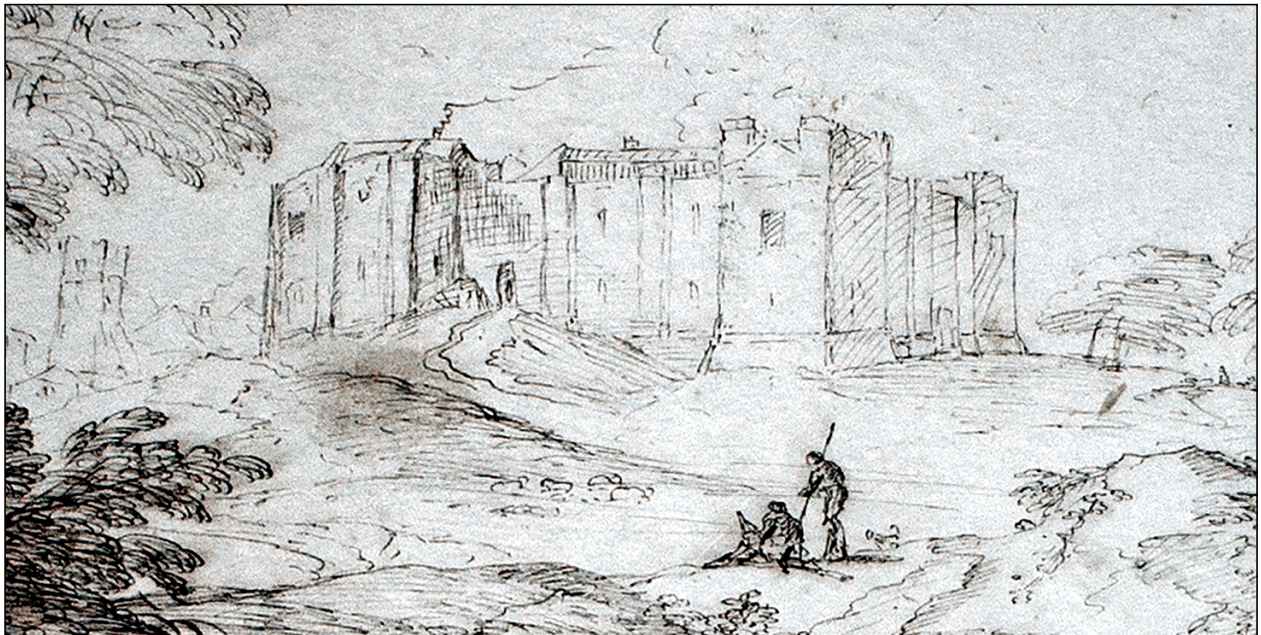
Fig. 47. Colchester Castle. A quick preparatory sketch drawing by Cornelis Bol (or Boul) (completed between 1650 and 1666). A cropped view of the east facade, with the apse of the chapel on the left. The door just to the right was probably created in the 16th or 17th century and has since been walled up. The original is at the Society of Antiquaries. Compare the Vertue engraving from a similar viewpoint.