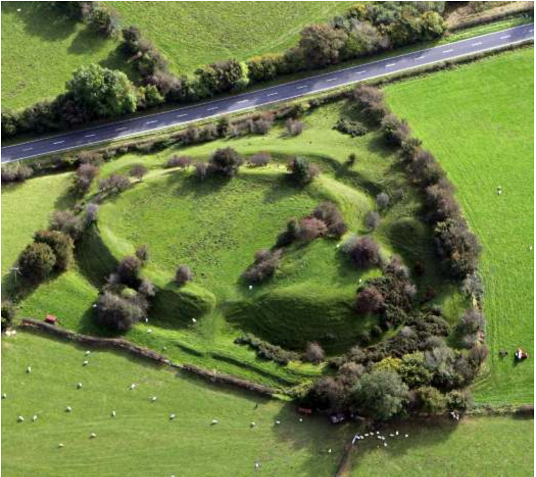
Tomen y Rhodywdd from the north, prior to tree clearance.